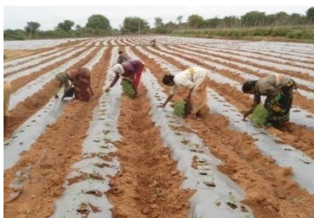
Fig: 1. Transplanting of tomato seedlings:

Transplanting: Transplanting seedlings were taken up on 6 th July 2015. At the rate of 5555 plants per acre were planted and it has been taken up in three replications and hence totally 16.665 plants were planted in the experimental plot.